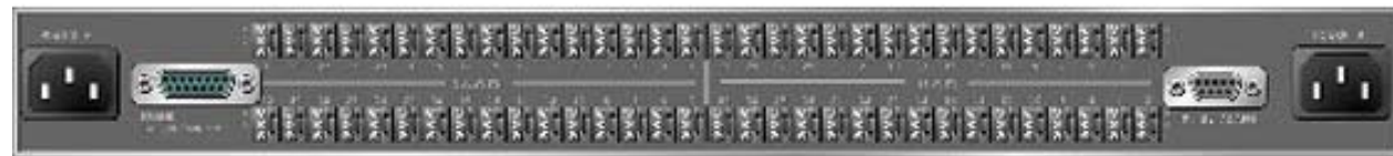
XL3232C 32x32 Video/Audio